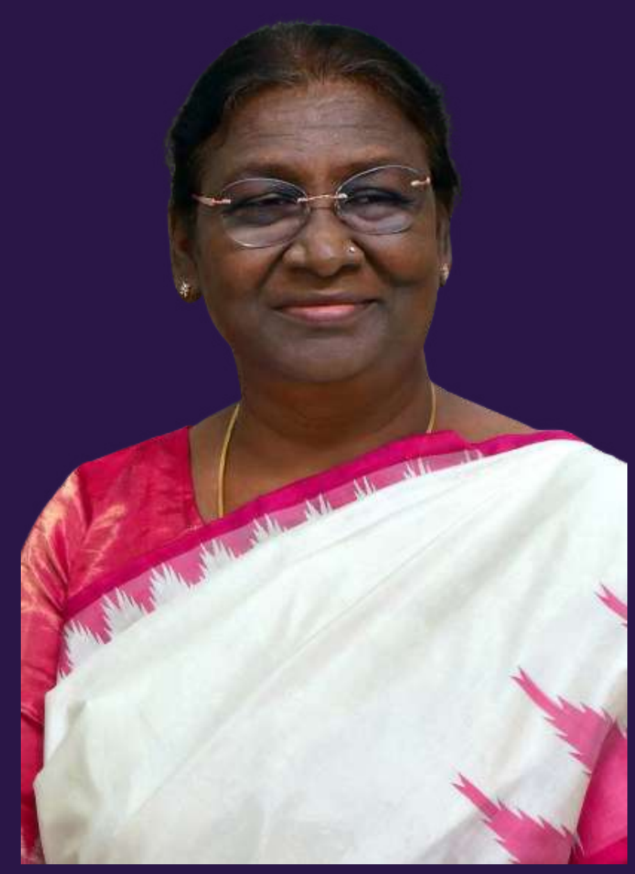
Hon'ble Droupadi Murmu President of India